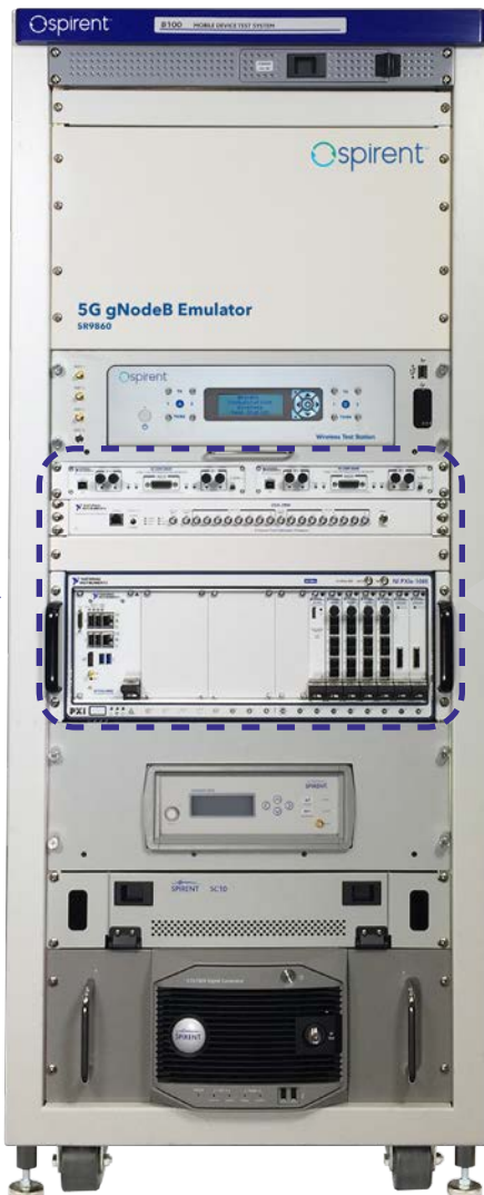
SR9860 Platform 5G gNB Emulator

Spirent mobile expertise, trusted advisor and world-class support