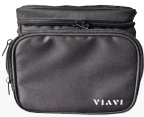
Fig 5: Single coupler carrying case