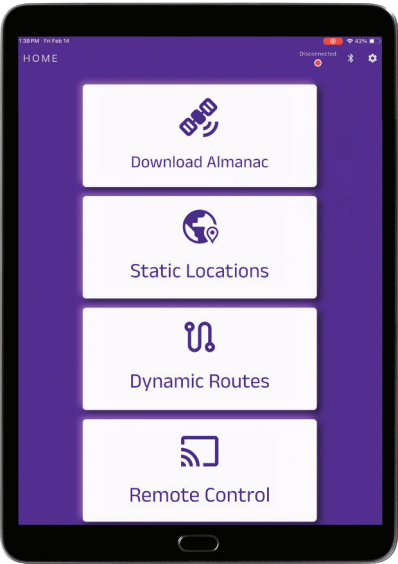
Fig 1: Remote application home screen