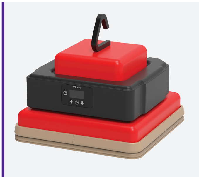
OSPREY Standalone GPS Simulator

The OSPREY GPS Simulator Controller can also be purchased and used without the VIAVI GPS coupler, for use with your existing coupler or via direct connect.