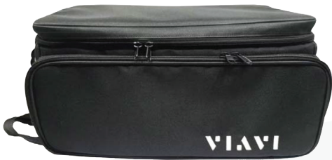
Fig 4: Dual coupler carrying case